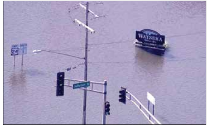
News file photos from the 2015 Watseka flood

You know, I can't really put into words how grateful I am to work for a company like Baker & Taylor. In January 2015, my significant other and I were devastated by the flood of Watseka, Ill. We woke up and went to work like normal, not thinking anything about the massive amount of rain that had fallen in the days prior. The day was just as normal as it could be until we got the phone call informing us that our house was surrounded by water. It broke our hearts, and still does, when we think about how everything we had worked so hard for in the past three years was practically gone.